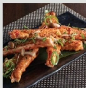
KING CRAB LEGS